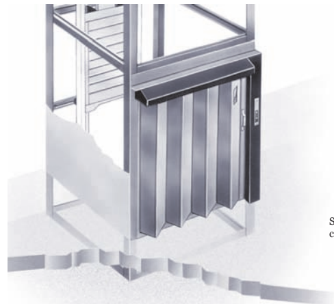
Space-saving concertina shutter leaf gate – can be installed as an optional extra.

To protect loads during travel a collapsible picket gate, electronically interlocked for safety, is available if required.